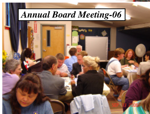
Annual Board Meeting-06