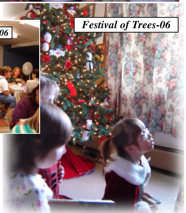
Festival of Trees-06