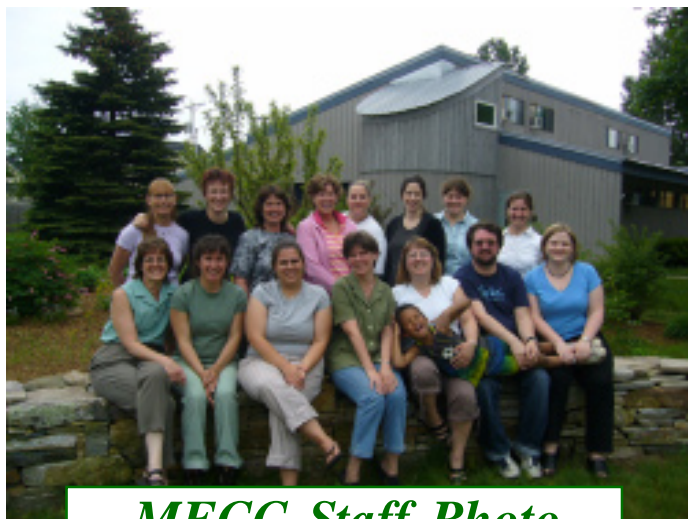
MFCC Staff Photo