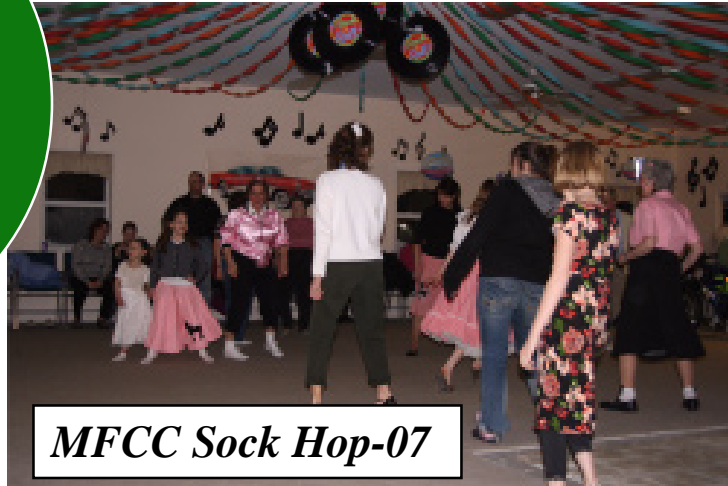
MFCC Sock Hop-07